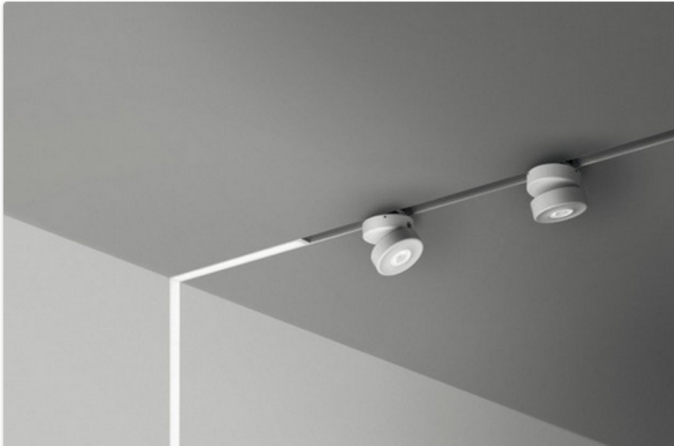
Innovative Lighting Fixture on a Low-Voltage Energy Magnetic Track by B Light