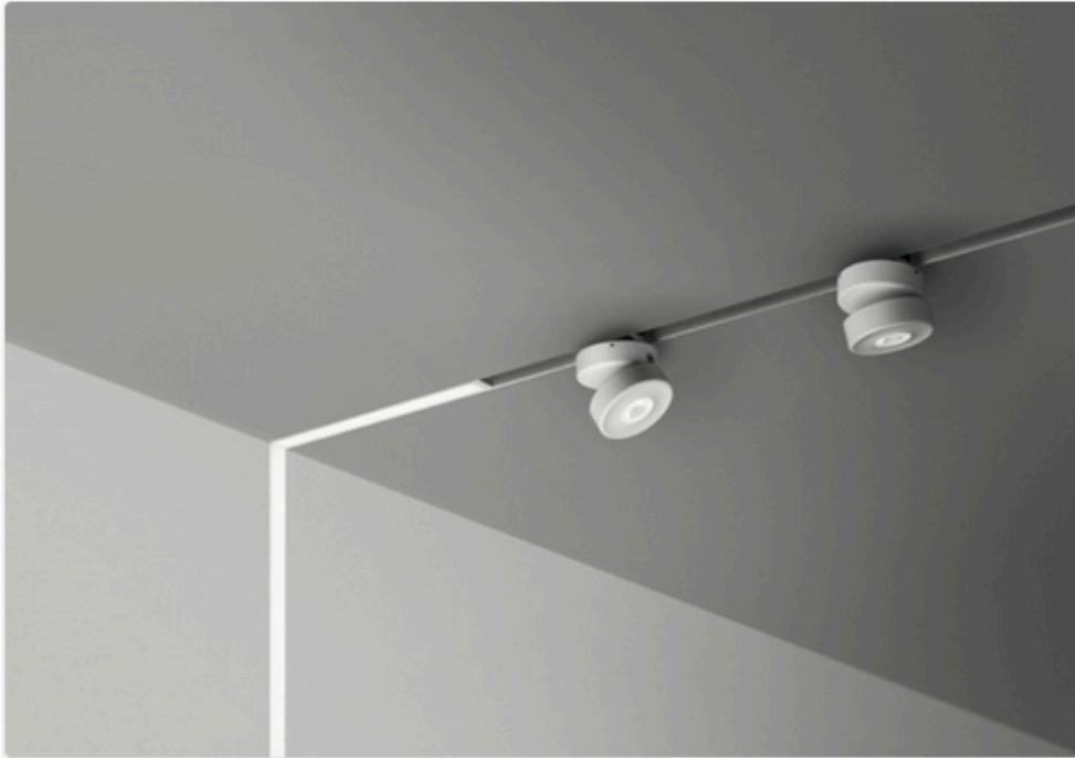
Innovative Lighting Fixture on a Low-Voltage Power Magnetic Track by B Light