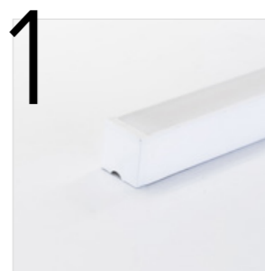
1 CONCEALED WIRING