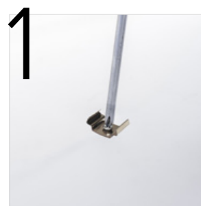
1 FIX CLIPS