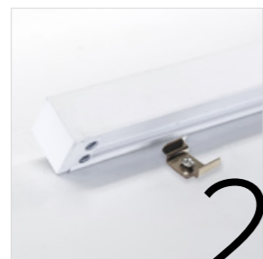
2 PRESS IN PLACE